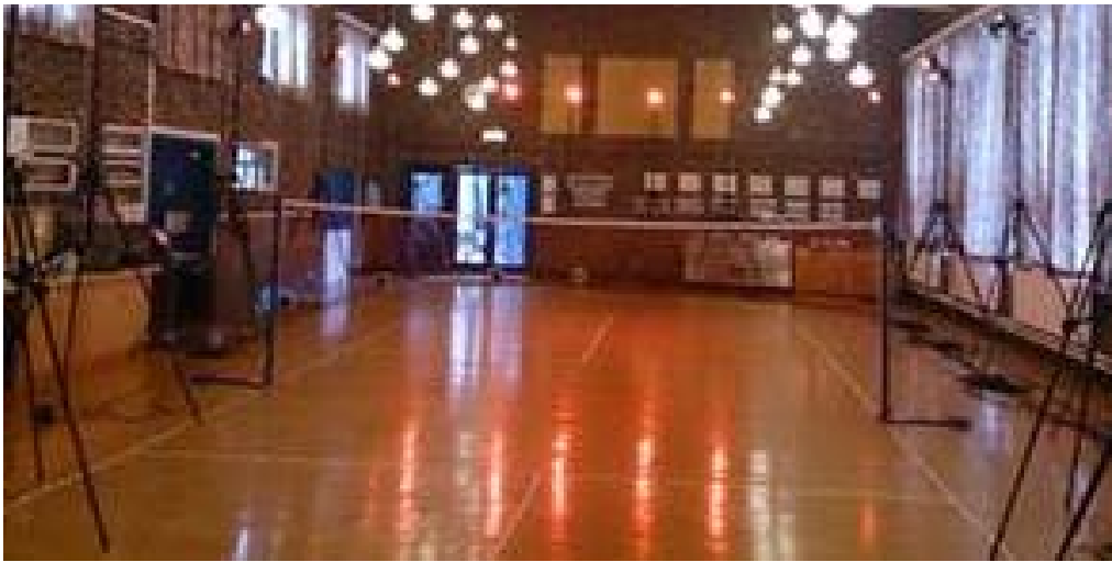
Figure 2. Data collection environment.

The shuttlecock position data were manually labelled and processed. Curves were fit separately to the pre- and post-impact phases (identified from the change in anterior-posterior direction) of the shuttlecock coordinate data in the vertical, anterior-posterior, and medio-lateral planes according to Equation (1) (Figure 3):