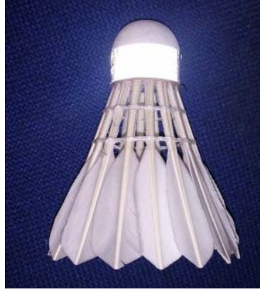
Figure 1. Reflective tape placement on the shuttlecock.